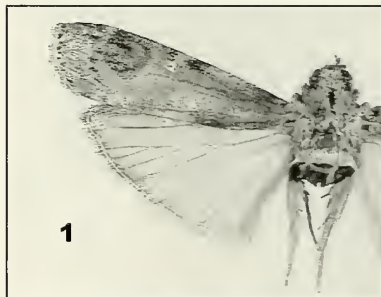
FIG. 1. Habitus of male Cavihemiptlocera exoleta .